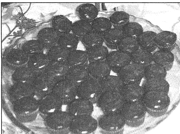
These delicious chocolate cupcakes were just one of many offerings during last year's Chocolate Extravaganza, sponsored by Emmanuel Church in Kailua.

For a full schedule of events, activities and meetings around the Diocese, check out the Calendar of Events on episcopalhawaii.org . Updated regularly, event submissions welcomed.