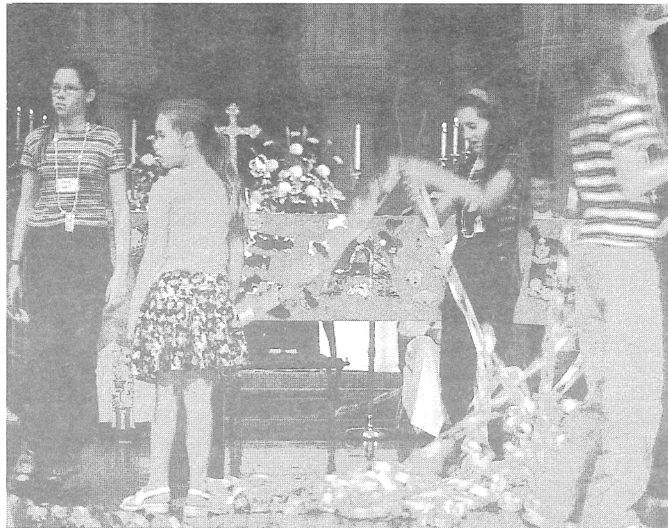
Participants made a lei of service bulletins from churches throughout the Diocese. The lei was over three hundred feet long and was passed among the congregation at the Peace.