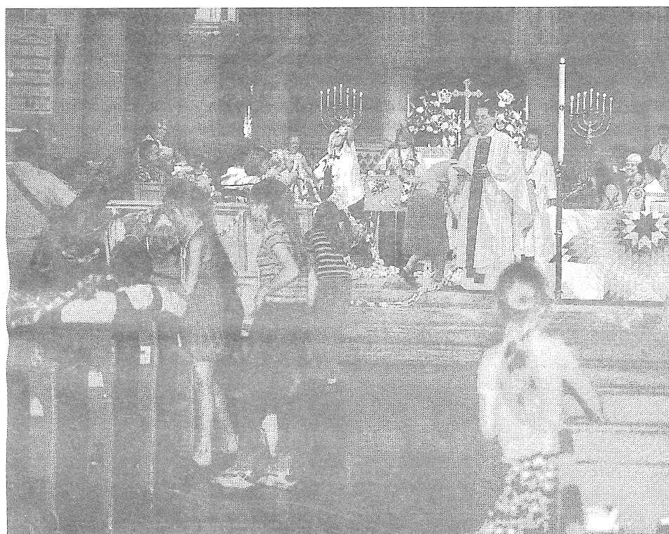
"Grandma, I have Chicken Skin" remarked one participant in the Spirit filled liturgy that was the culmination of "Cathedral Day".