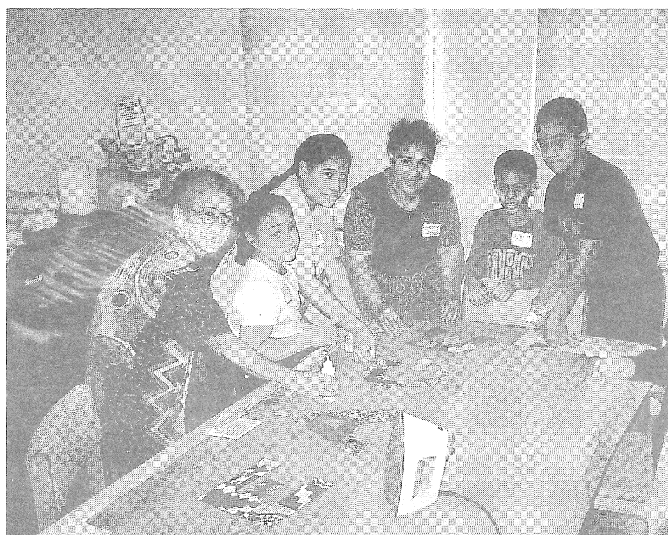
Members of the Diocesan Altar Guild and St. Elizabeth's Church work on the Peace Banner that was carried in procession in the liturgy and formed the altar frontal.