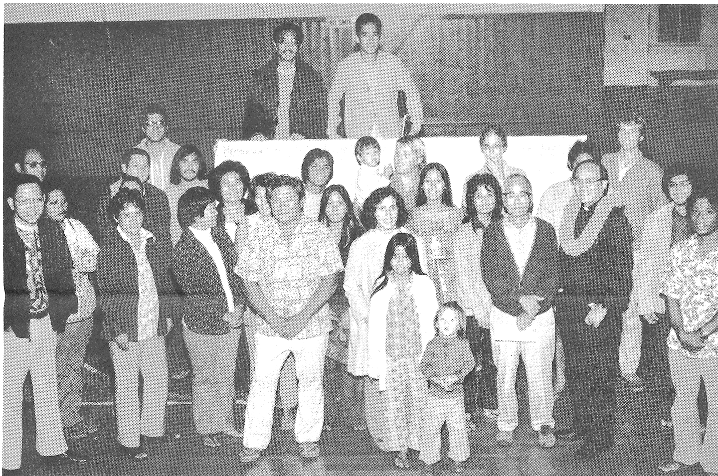
That check brought lots of happy faces to the Kilauea Gymnasium, and it will continue to do so through the community program developed by Christ Memorial Church and the people of Kilauea.