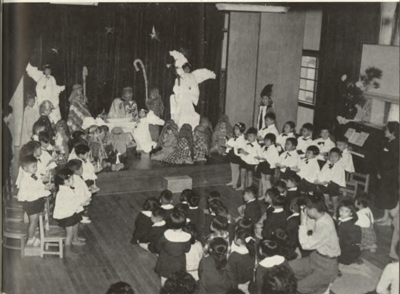
Children of the Nazareth Kindergarten, Mawashi, Okinawa, have a Nativity Pageant.

HAWAIIAN COLLECTION GREGG M. SINCLAIR LIBRARY UNIVERSITY OF HAWAII