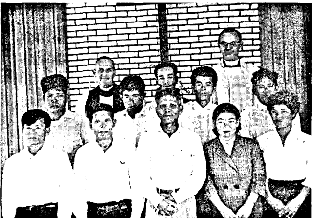
Confirmation Class at Miyako Leper Colony