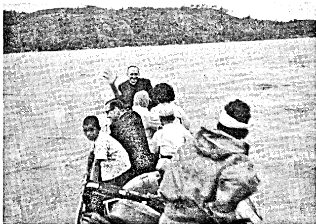
Boat to Leper Colony, House of Prayer, Airaku-en, Okinawa.