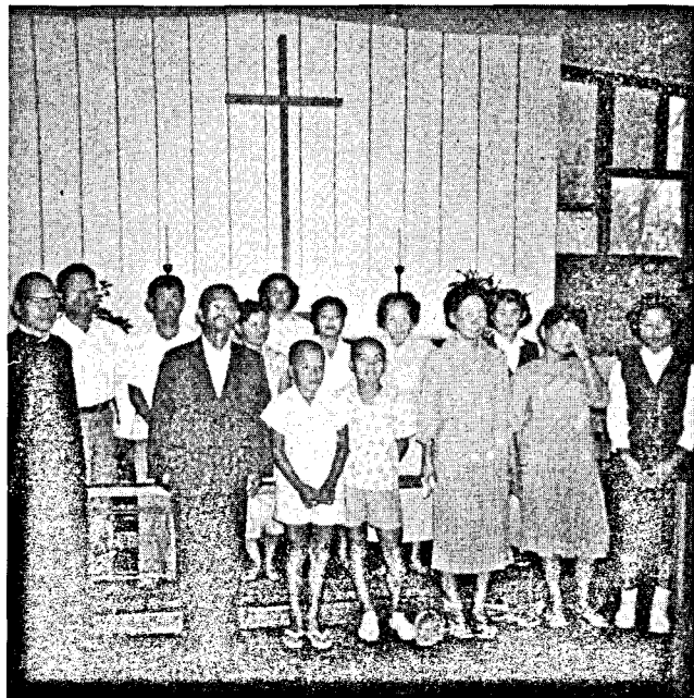
Confirmation Class at Leper Colony, Airaku-en, Okinawa.