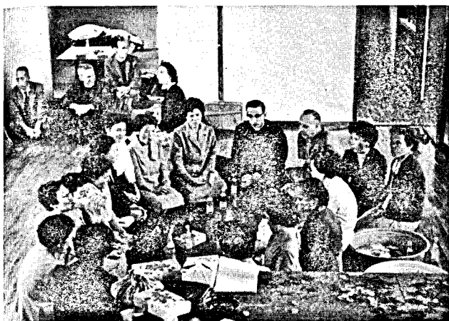
Reception at Leper Colony, Miyako.