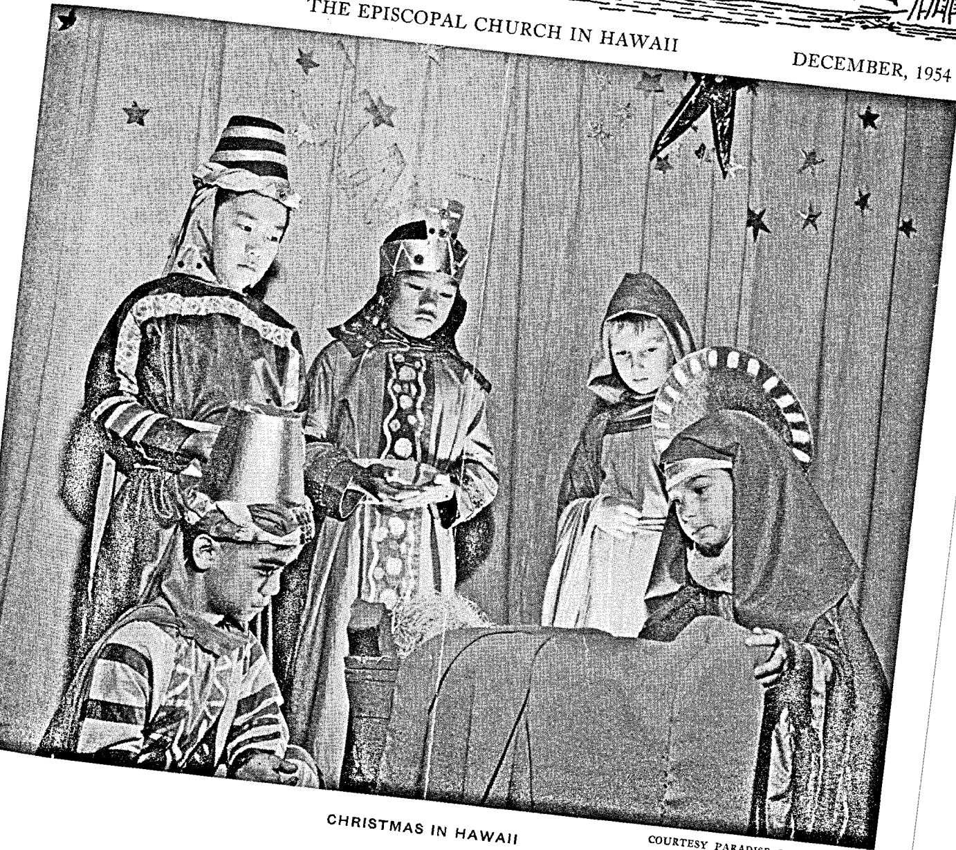
CHRISTMAS IN HAWAII