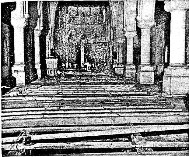
Termites took their toll of the St. Andrew's Cathedral, Honolulu, floor. This shows it being torn up to put in new concrete floor.