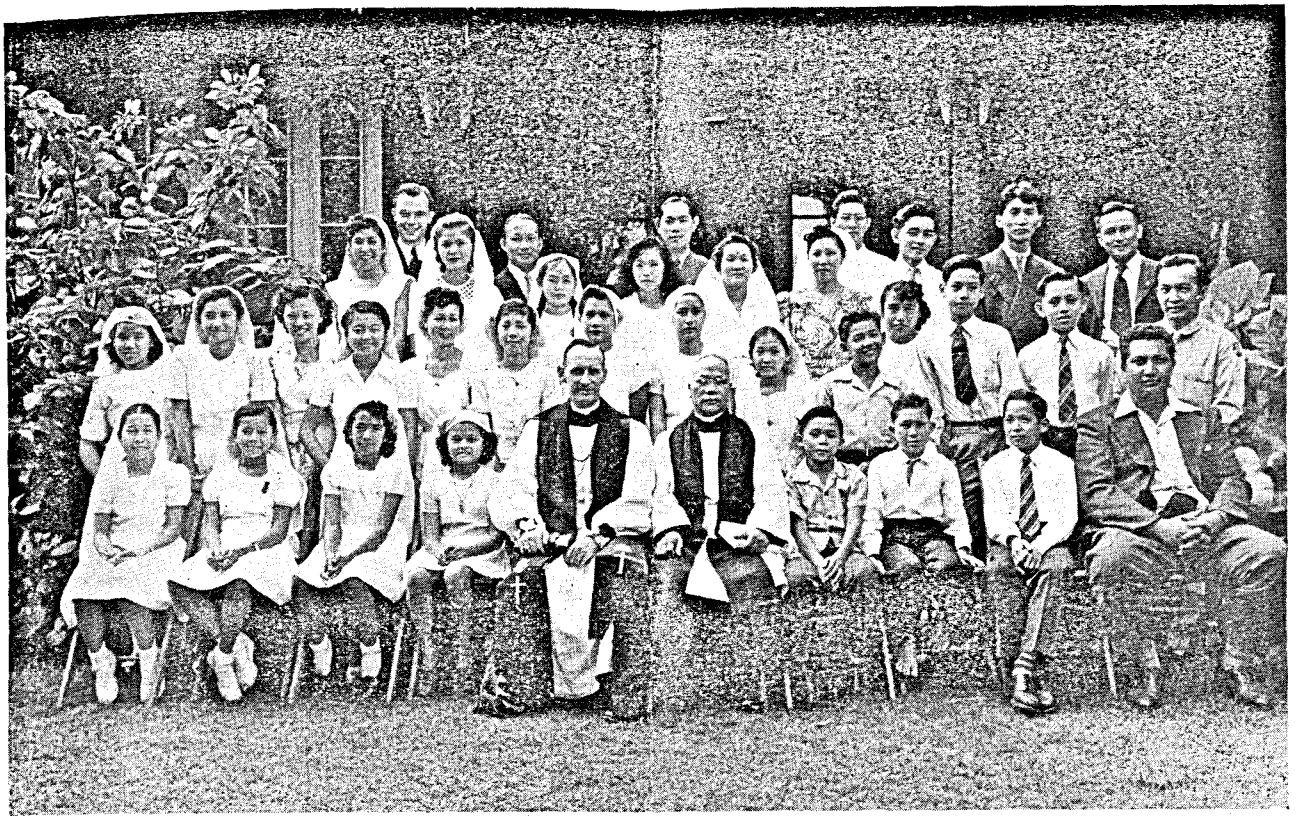
CONFIRMATION CLASS, ST. ELIZABETH'S MISSION, DECEMBER 23, 1945