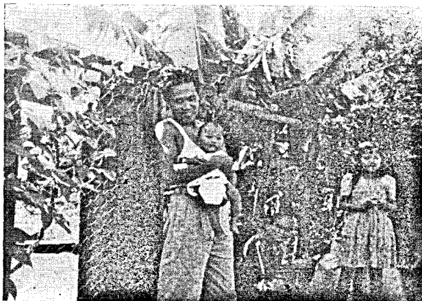
Filipino members of St. Peter's Mission, Kauai. The youngest and oldest members are pictured here.

The Conference will then meet for election of officers, the discussion of the aims for the year, reports, etc. Supper will be held in the Diocesan grounds and will be followed by a candlelight service in the Cathedral.