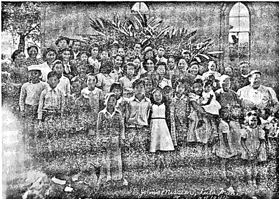
Congregation of St. John's, Kula, Hawaii