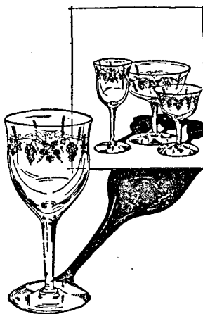
The Vintage Pattern

W. W. Dimond & Co. Ltd. THE HOUSE OF HOUSEWARES 53-65 KING STREET, HONOLULU