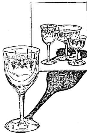
The Vintage Pattern

Dear to the heart of every woman are her jewels. She takes pride also in the possession of at least a few jewels of the well-dressed table—it's Glassware. Because of the acceptability of glassware as gifts, she will be interested to know that Dimond & Company displays the most comprehensive collection of the finer glassware in Honolulu. It comprises excellent pieces of pressed, blown and cut glass from such famous makers as: Paden City Glass, Luzerne Cut Glass, Heisey Glass, Fenton Art Glass, Murano Italian Glass.