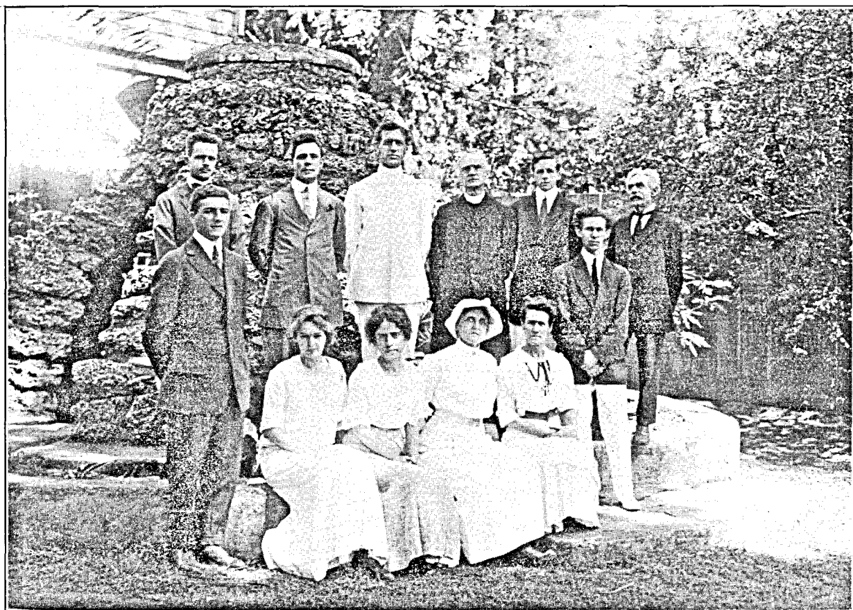
TEACHING STAFF OF IOLANI, 1914-15.